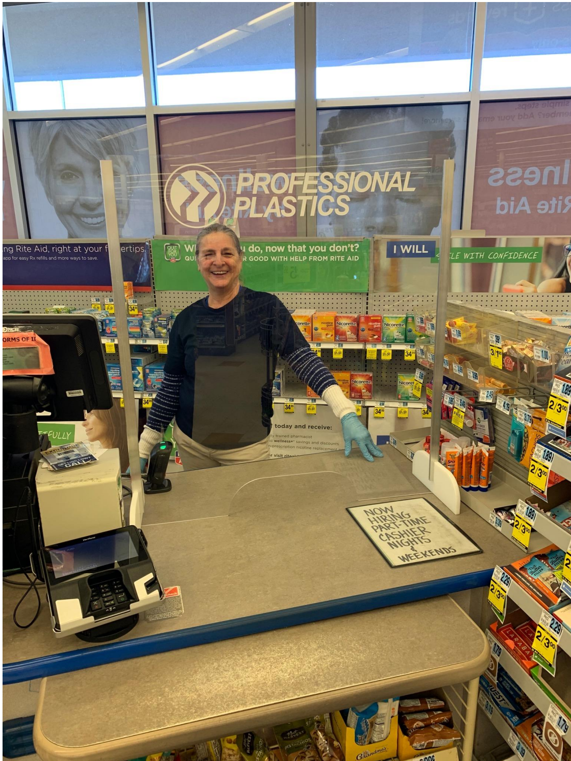
Pharmacy Countertop Shield with Pass-Thru