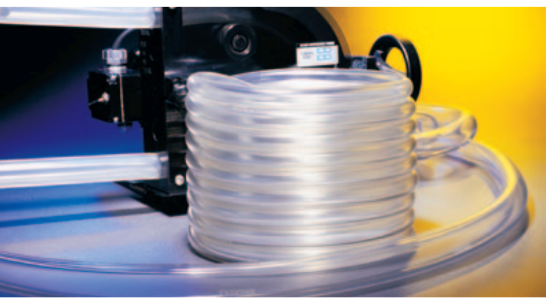
Crystal-clear TYGON <sup>*</sup> Long Flex Life Pump Tubing optimizes peristaltic pump performance in numerous applications including bulk transfer.